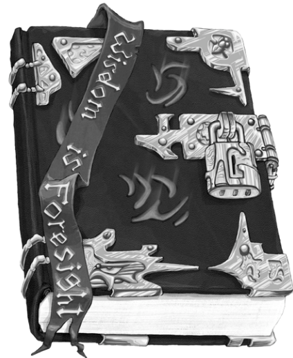
Crimson Codex Faction Symbol

This is a faction adventure for the Crimson Codex. This means that the story is suited for that group, and can only be played by Crimson Codex characters. As the DM you should make sure that only member of this faction play in this adventure, as play of another faction's character could invalidate the entire session.